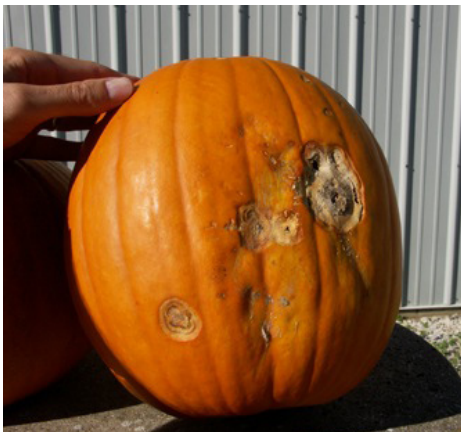
Figure 1: Fusarium fruit rot of pumpkins results in soft lesions on fruit, which may cause crater-like holes in the fruit.