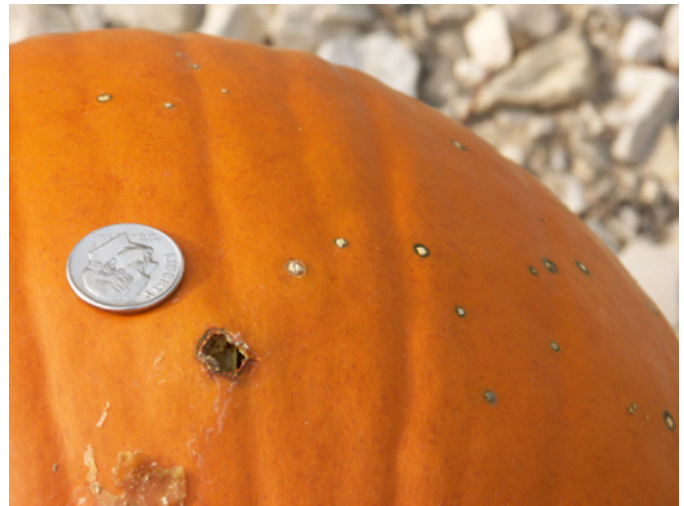
Figure 2: Bacterial spot of pumpkins causes pimple-like lesions on fruit; occasionally some lesions may be come secondarily infected resulting in unsightly holes.